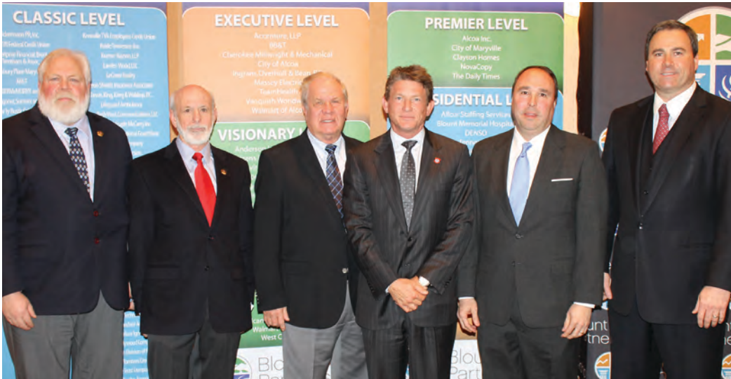
TeamHealth announced its third expansion in Blount County in January with the establishment of its Healthcare Financial Services anesthesia operations.