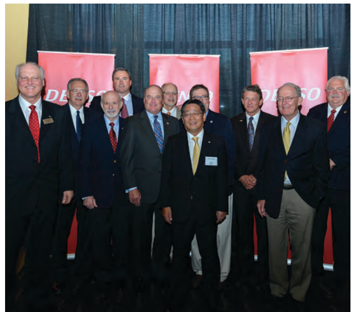
DENSO celebrated its 25th Anniversary with a huge expansion announcement.