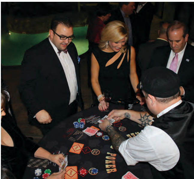
The Blount Partnership's Anniversary Celebration had a little something for everyone with great food, entertainment and a casino.