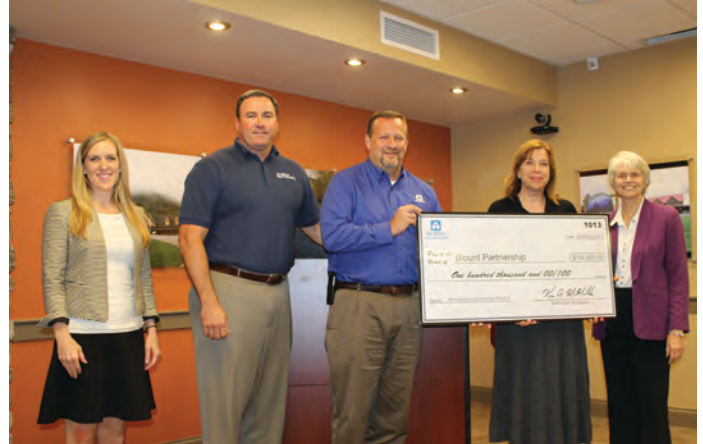
The Blount Partnership received a $100,000 grant from Alcoa Inc. Foundation to continue the Youth Workforce Readiness Training and Intern Program.