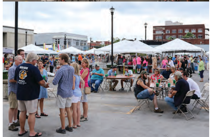
The inaugural Hops in the Hills craft beer festival was a huge success as an anchor event for Summer on Broadway.