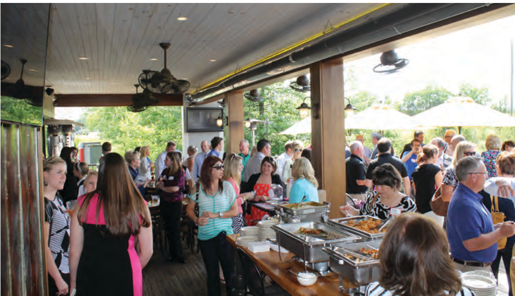
This afternoon mixer at Calhoun's was one of over 40 networking events held throughout the year. There's no better way to get out a meet a lot people than at the Blount County Chamber event. You never know who's going be there.