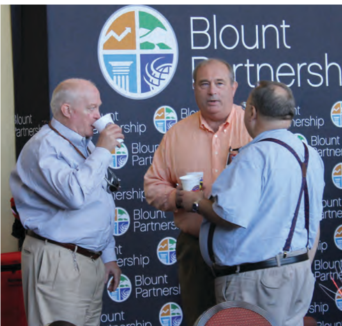
Pigs and Politics Legislative Day brought together elected officials from around the county.