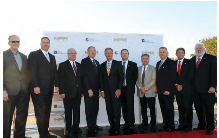
Advanced Munitions International made the largest economic development announcement in Blount County history.