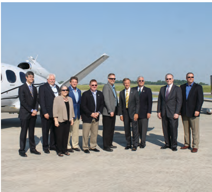
Gov. Bill Haslam announced Cirrus Aircraft is bringing its 'Vision Center' to McGhee Tyson Airport.