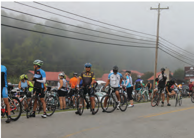
The Townsend Bike Bash and Smoky Mountains Half Marathon are two examples of the focus on outdoor sport activities in Blount County. Both saw huge increases in participation and made an economic impact.