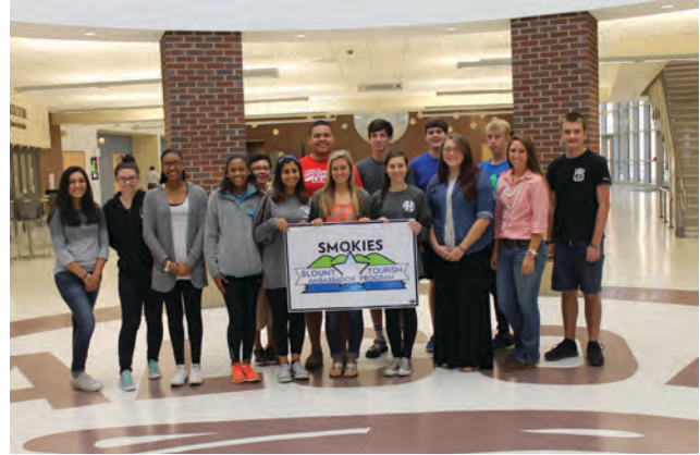
The Blount Tourism Ambassador Program was expanded into the high schools in 2015.