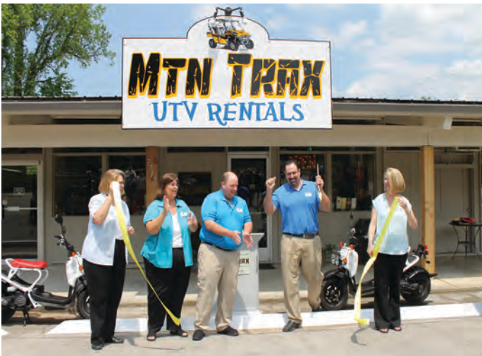
The ribbon cutting at Mtn Trax in Townsend was one of 24 held for Chamber members.