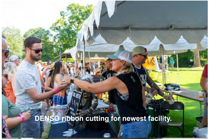
DENSO ribbon cutting for newest facility.