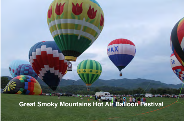
Great Smoky Mountains Hot Air Balloon Festival