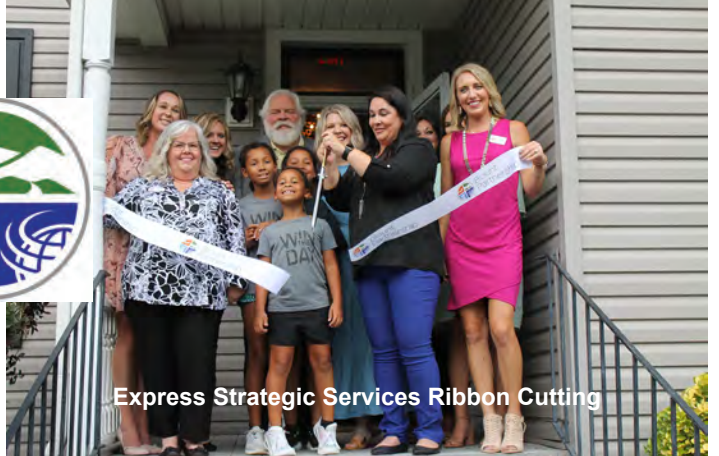
Express Strategic Services Ribbon Cutting