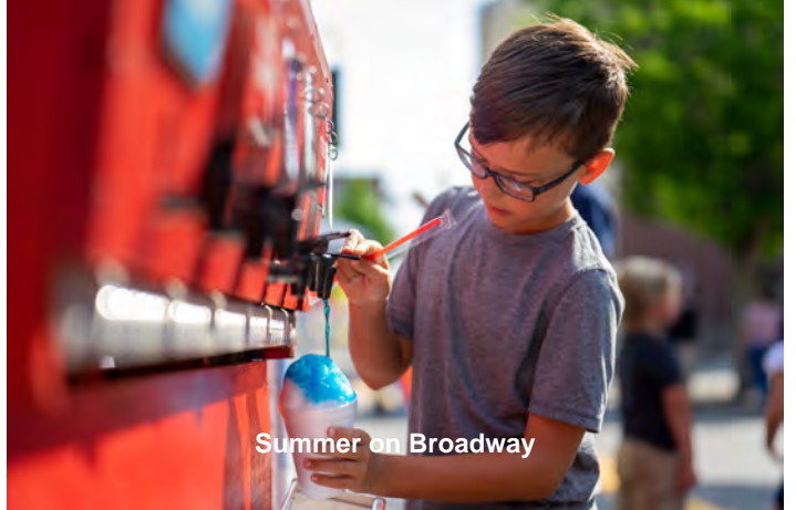
Summer on Broadway