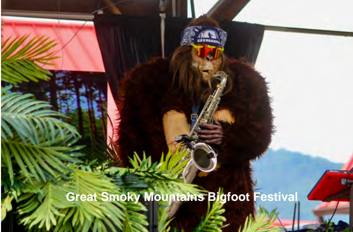
Great Smoky Mountains Bigfoot Festival