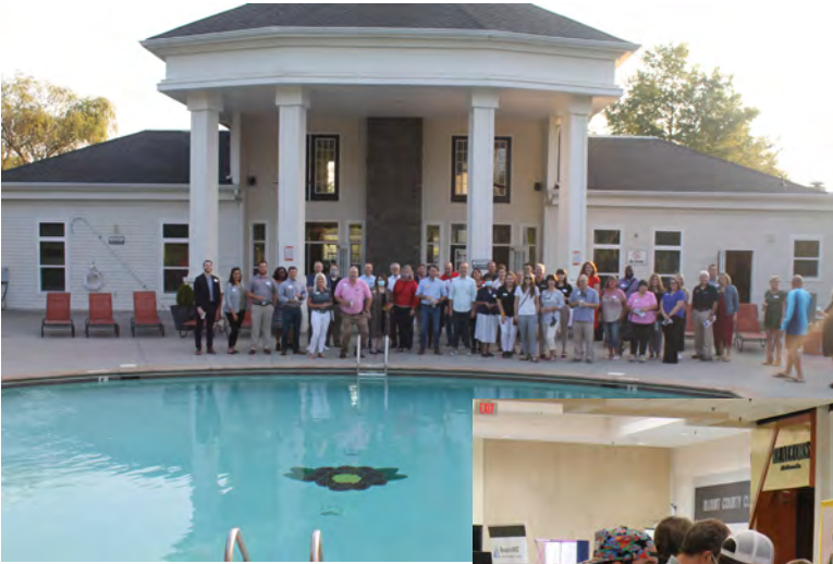
Clockwise Photos (L-R): Coffee Club at Camellia Trace Apartments, Blount County Job Fair, Young Manufacturers, Blount County Job Signing Day, Small Town BBQ Ribbon Cutting.