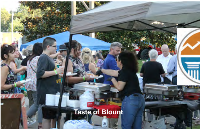
Taste of Blount