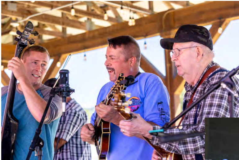
Clockwise Photos (L-R): Townsend Fall Festival, Hops in the Hills (2), Summer on Broadway.