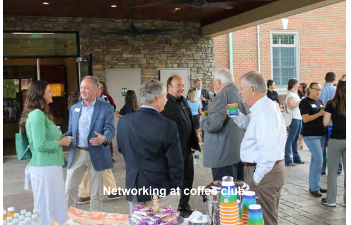
Networking at coffee club